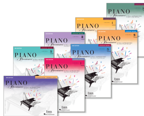
Faber Piano Adventures Library